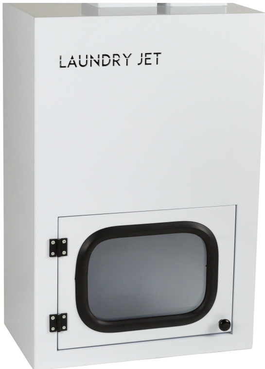
Dimensions in mm

The Laundry Jet Return unit is the must-have option for any home wanting to totally close the circle on laundry transport to and from the laundry room. Send clean and dried items back to the room most appropriate for receiving them. Especially useful if your bedrooms are upstairs and your laundry room is on a lower floor. Install a port in your Laundry room, install the Return Unit in the chosen bedroom, pipe in and enjoy dirty laundry delivery from bedrooms to laundry room and clean and dry laundry delivery from the laundry room back to the chosen bedroom.